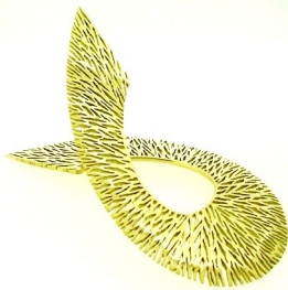
Ilze Oberholzer’s award winning design representing the AIDS crisis in South Africa.

Full details of the classes are available on the chapter website: www.fsgne.com and updates are on our blog: www.fsgnortheastchapter.blogspot.com . The chapter can be reached at: fsgne@yahoo.com .