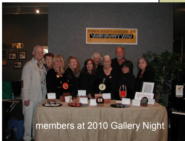
members at 2010 Gallery Night

As we pursue more visibility in the community, we are offering metal-smithing classes, participating in public demonstrations, talking about FSG-GP at other venues and generally promoting our group. Our goals are to increase our visibility in Pensacola and the surrounding areas, continue teaching classes, increasing our offering of classes, and welcoming new members into our exciting world of metals.